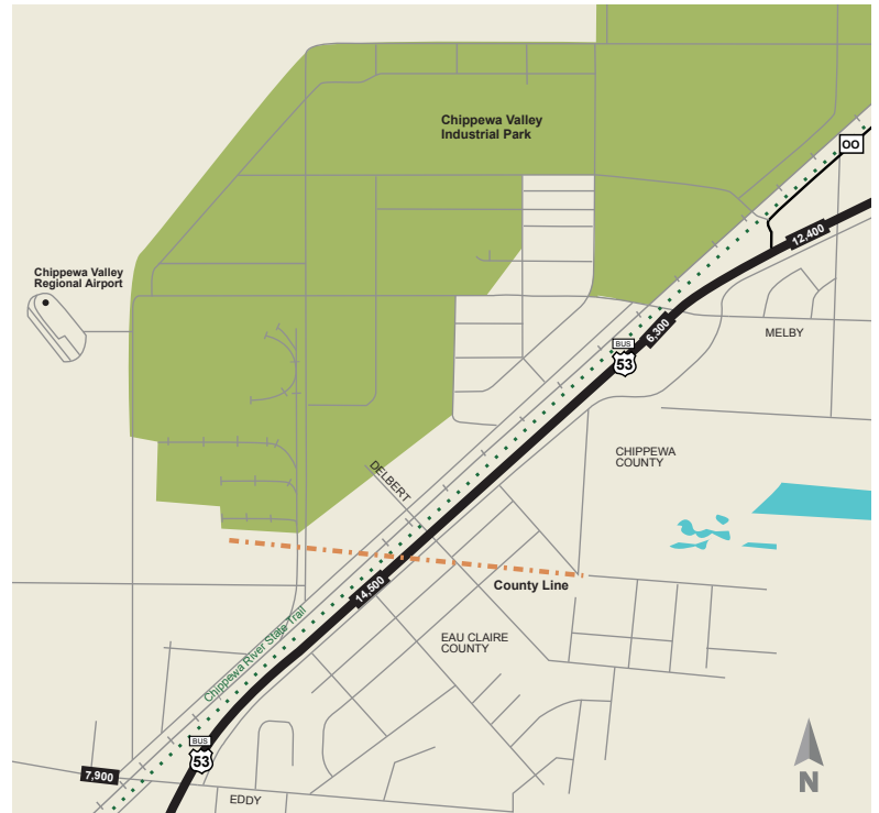
Traffic Count