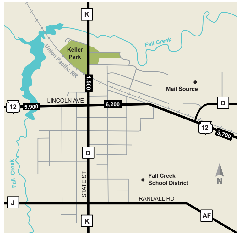
Traffic Count Source: Department of Transportation, May 2014