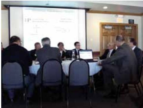
2008 - EDC board members discussing early-stage financing structures.

In December, the EDC met with over 15 executives from area financial institutions to discuss the financing gaps identified by the EDC. In advance of this meeting, the EDC had researched successful financial programs operated elsewhere that would address the financial gaps.