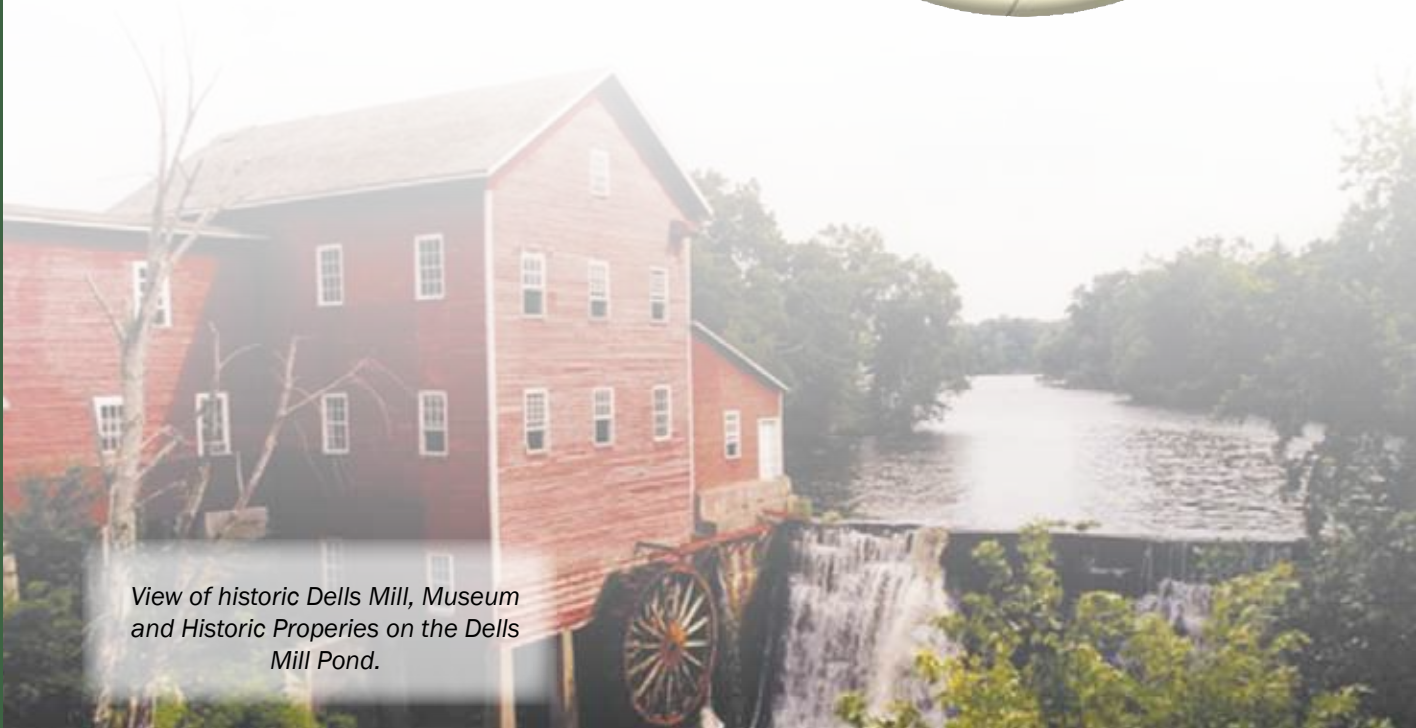
View of historic Dells Mill, Museum and Historic Properties on the Dells Mill Pond.